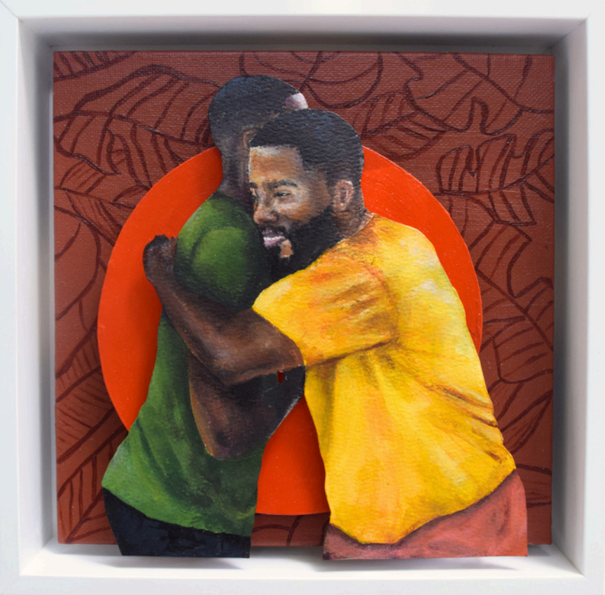
GYAL. I GOT YOU!, 2024 8" X 8" Mixed Media on Canvas